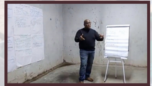
In November 2023, WOAN visited Kenya to receive 2023 project updates and to meet with various community leaders in preparation for 2024! Click here to view highlights of this visit!